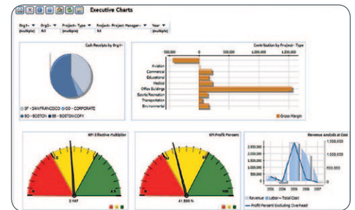
Fig. 2: The pre-configured Executive role-based dashboard provides data about the overall financial health of your business.