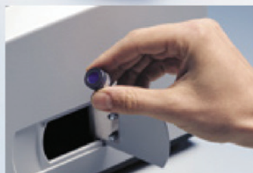
Filters are easily changed

The Expert Plus microplate reader is a stand alone instrument that combines a large graphical display with easy to use on-board software, digital light control for optimum performance and multi channel optics for fast analysis times. Qualitative, quantitative and kinetics capabilities are available with a range of curve-fit methods including linear, parabolic, cubic, point to point, spline and 4-parameter. Up to 120 methods can be stored in memory, as can the results from up to 100 plates and these results are downloadable to an external PC using the Control Plus software which is supplied as standard. The Expert Plus is the ideal choice for analysts who have a number of 96 well plate methods to be run and the results can be easily printed out to an external printer via the standard parallel port. It has both exciting styling and design that place it at the forefront of its class.