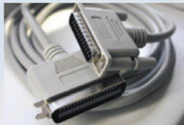
Directly connectable to a printer