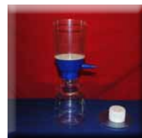
Bottle Top Filters